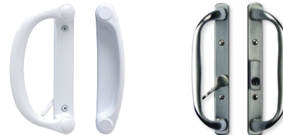
White | Beige | Dark Bronze

Color-coordinated handle set is included. An optional Satin Nickel handle set with a key is available.