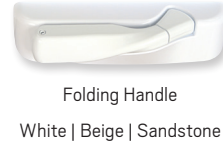
White | Beige | Sandstone

Color-coordinated folding handle lock is standard.