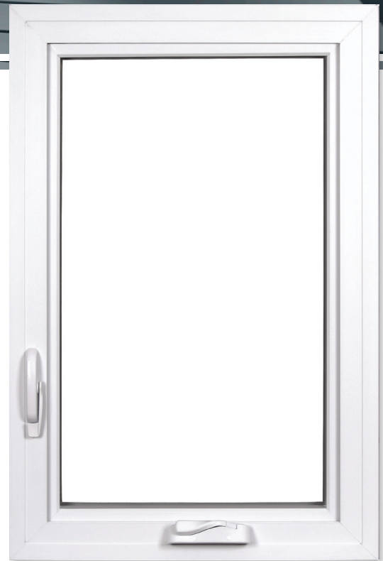
Casement window shown