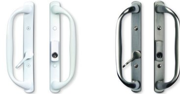
White | Beige | Sandstone

Color-coordinated handle set with key is standard. Or select an optional Satin Nickel finish.